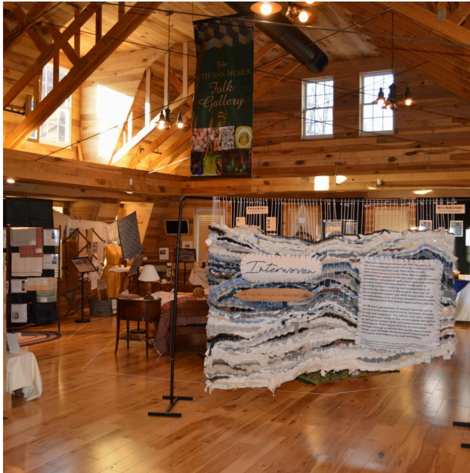
The Folklife Center's current exhibition Interwoven , which is on loan through July 2026 from Arthurdale Heritage and showcases regional fiber arts.

The Folklife Center is part of the College of Liberal Arts and houses the University's undergraduate programs in folklore and museum studies. A Folklore Studies specialization provides a background for professional involvement in such areas as preservation, cultural heritage and historical parks and museums management, teaching, archiving, curating, entertainment, storytelling, writing, traditional arts, and graduate studies. Additionally, the Folklife Center serves the University and the broader community through events and workshops, all of which are free and open to everyone, as well as through scholarships, publications, exhibitions, and outreach events.